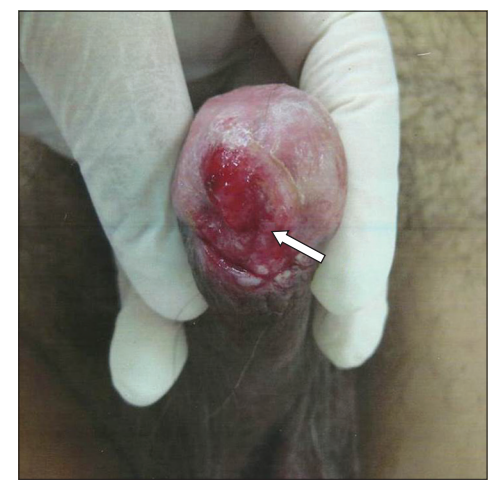
Fig. 1 Patient 1: Photograph shows effaced urethral meatus (arrow) that caused lower urinary tract symptoms.

The average duration of the presenting complaint was 4.4 (range 0.5–12.0) months. The presenting complaints included bloody discharge from the penis (Fig. 1), penile swelling, penile redness, obstructive lower urinary tract symptoms and inguinal lumps. The tumour was located at the glans penis in five of the patients and the prepuce in one patient. Patient 6 presented with symptomatic anaemia and was found to have an effaced penis on physical examination (Fig. 2). All of the patients underwent